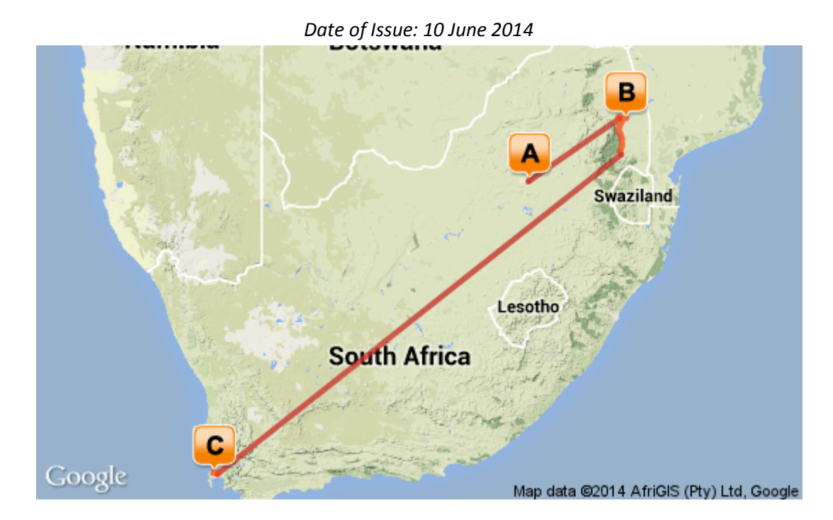
Click here to view your Digital Itinerary