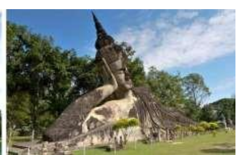
DAY 11: VIENTIANE > YOUR CITY