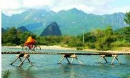
DAY 10: VANG VIENG - VIENTIANE