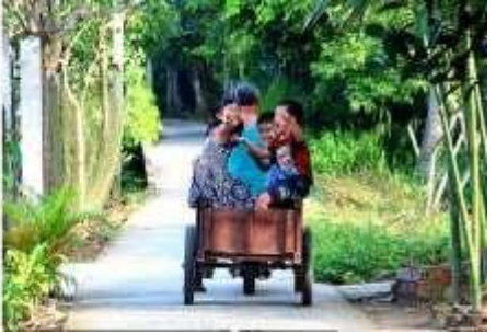
DAY 5: LONG XUYEN - CHAU DOC Breakfast at the homestay.

Morning visit of the floating market of Long Xuyen , which is the most authentic in the region. Discovering a floating village, living of fish farming and a water garden. Boarding and drive to Chau Doc through peaceful landscapes of the Mekong. Lunch on the road