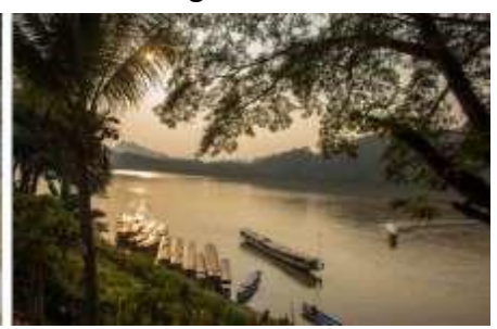
DAY 6: LUANG PRABANG - PHONSAVAN