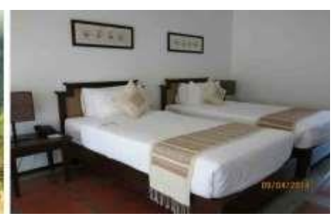
DAY 9: VANG VIENG