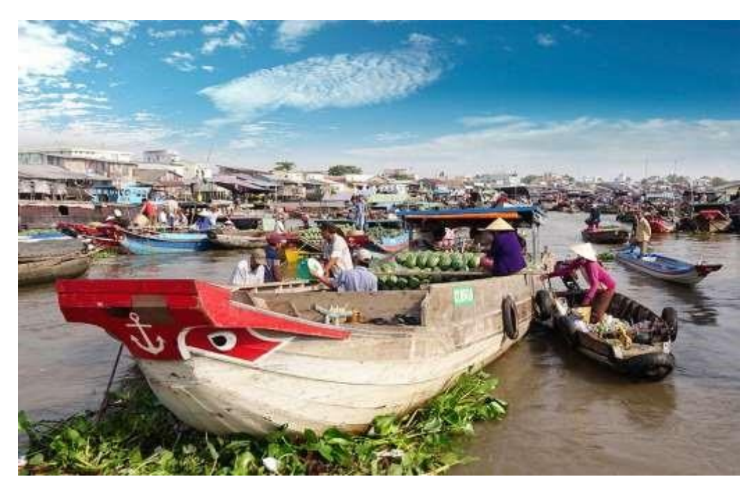
The best of cruising along the Mekong