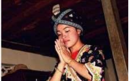
DAY 7: PHONSAVAN – PLAIN OF JARS - PHONSAVAN