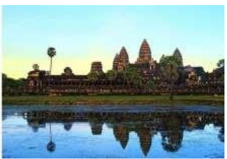
DAY 4: SIEM REAP