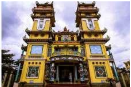
Arrival in Can Tho. Leisure time to explore the river banks. Dinner at your expense. Night at the hotel.