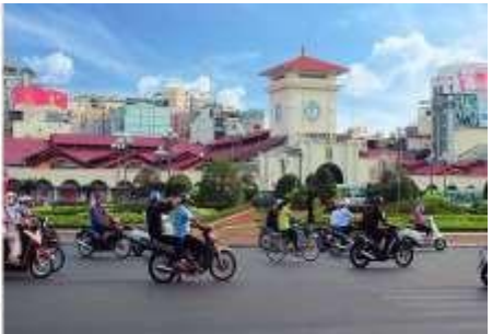
Rest of the day to rest and explore the city at leisure. Welcoming dinner in a restaurant in town. Night at the hotel.